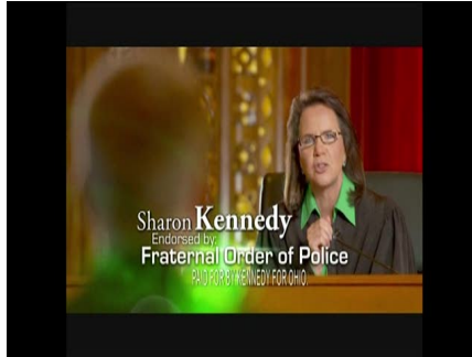
16 YEARS AS A JUDGE