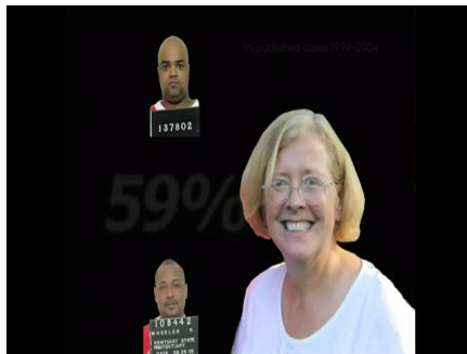
Former Justice Janet Stumbo sided with criminals fifty percent of the time