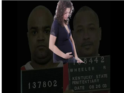
for ruthlessly murdering pregnant women