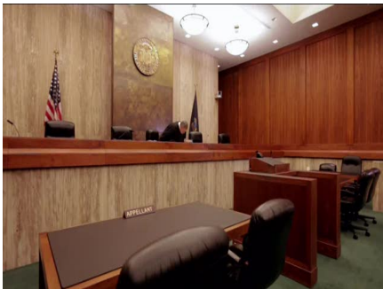
with 20 years of judicial experience,