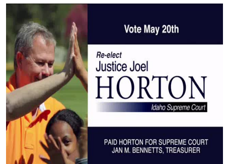
has been my greatest honor.