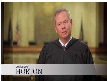
Upholding the Constitution and serving Idahoans