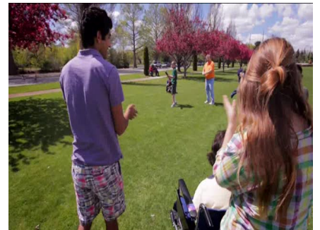
For 15 years,