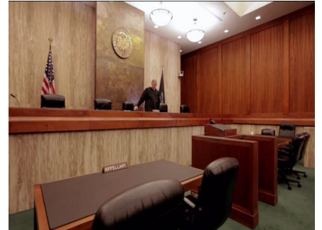
An Idaho native