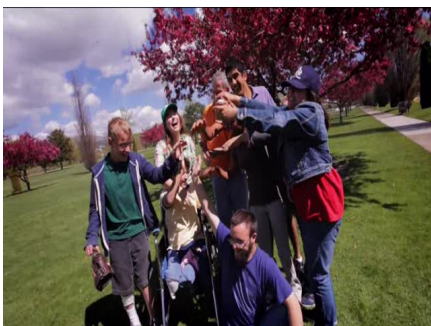
Horton believes in upholding Idaho's Constitution.