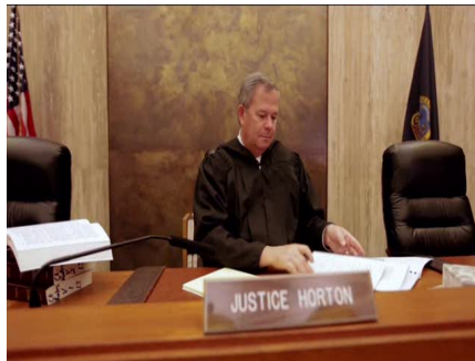
Horton dedicates himself to justice and to giving back.