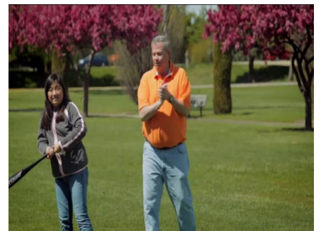
Appointed by Governors Batt and Otter,