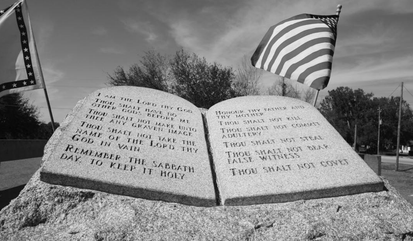
The Ten Commandments monument that was installed in the Alabama state judicial building by Chief Justice Roy Moore.