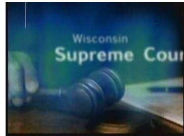
Butler sides with criminals nearly 60 percent of the time.