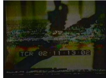
witness testimony, fingerprints at the crime scene and blood under