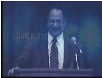
rapist conviction. On cases taken up by the Supreme Court,