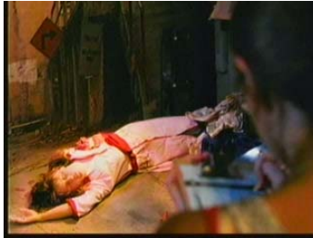
and strangling a 19-year-old coed to death. There was eye