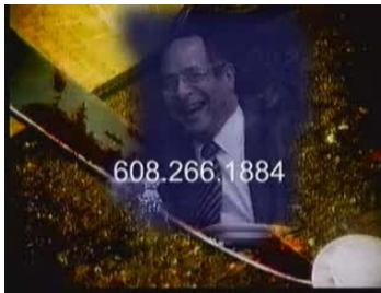
[PFB]: COALITION FOR AMERICA'S FAMILIES