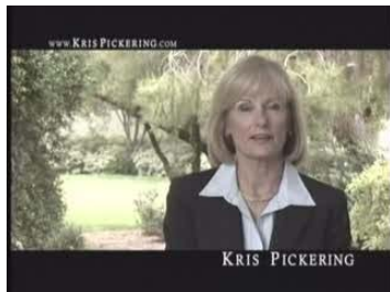
of all Nevadans." [Announcer]: For judicial ethics, pick Pickering for Supreme Court.