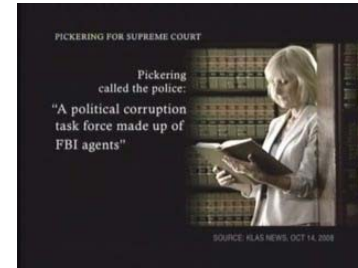
triggering an FBI investigation into judicial corruption.