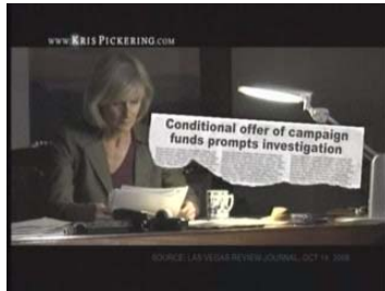
[Announcer]: When Las Vegas insiders tried to coerce special treatment

Brand: POL-SUPREME COURT (B333) Parent: POLITICAL ADV Aired: 10/31/2008 - 11/02/2008 Creative Id: 6824578