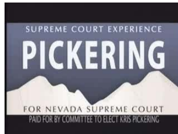
[PFB]: COMMITTEE TO ELECT KRIS PICKERING