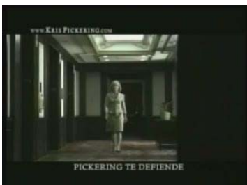
For judicial ethics pick Pickering for Nevada Supreme Court.