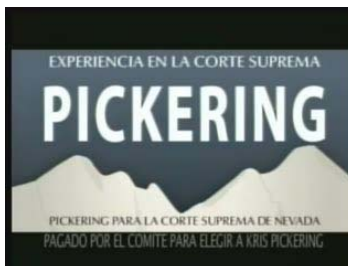
[PFB]: COMMITTEE TO ELECT KRIS PICKERING