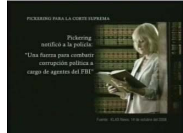
into judicial corruption. No wonder our police endorse