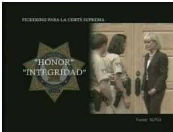
The Review Journal endorses Pickering's refusal to flinch in tough