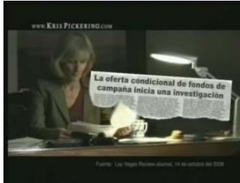
called the police and blew the whistle. Triggering an FBI investigation