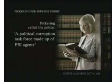
blew the whistle, triggering an FBI investigation into judicial corruption.