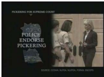
No wonder our police endorse Pickering for Supreme Court, praising