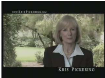
Protecting your rights and the rights of all Nevadans." [Announcer]: For judicial ethics,