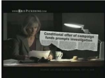
[Announcer]: When political insiders try to extort