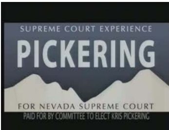
pick Pickering for Nevada Supreme Court. [PFB]: COMMITTEE TO ELECT KRIS PICKERING